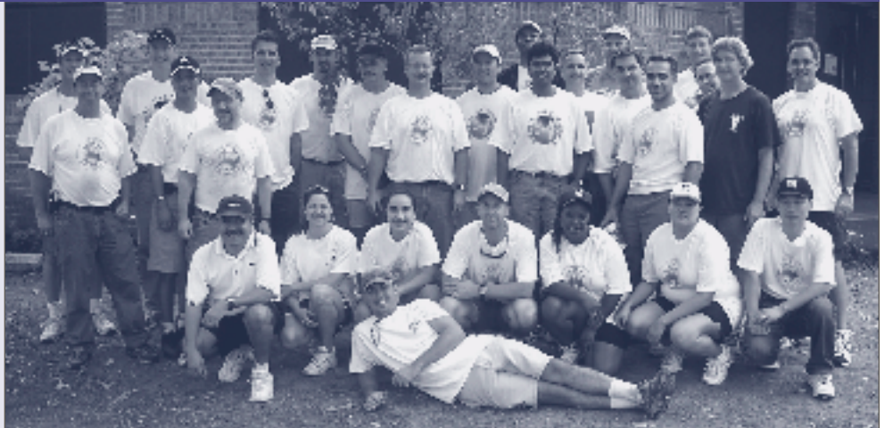
A team from Dell's World Wide Procurement Supplier Engineering and Quality Engineers volunteered to work on improving the AGE Building in September.

For information on volunteering, call 451-4611 or visit us online at www.ageofaustin.org .