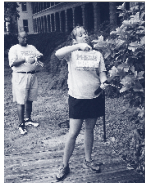
Volunteers from the Austin American-Statesman worked at the AGE Building for United Way's Day of Caring in September.