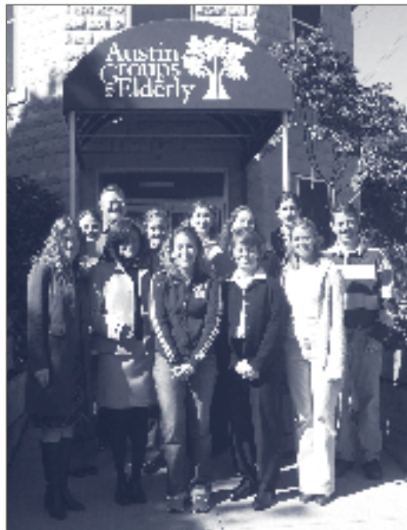
Volunteers from United Way Capital Area's Development Office assisted Elderhaven clients in November.